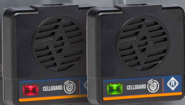
CELLGUARD™ WIRELESS Battery Monitoring System